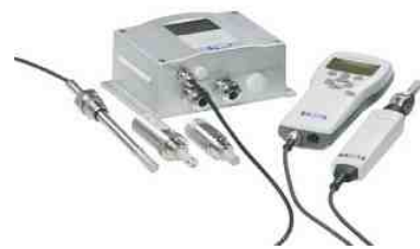
Vaisala DRYCAP® Dew Point Transmitters