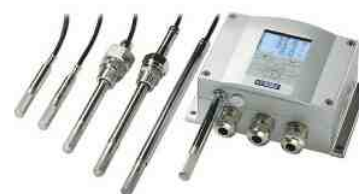
Vaisala HUMICAP® Humidity and Temperature Series HMT330 for excellent performance