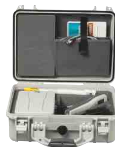
The PTB330TS comes in a durable and weatherproof transport case that can be easily carried and shipped