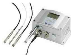
Vaisala BAROCAP® combined pressure, humidity and temperature transmitter PTU300