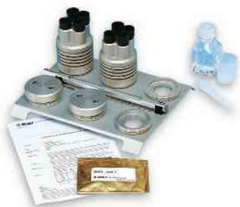
HMK15 Salt Humidity Calibrator