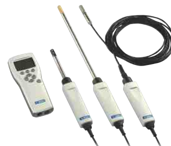
Vaisala HUMICAP® Hand-held Humidity and Temperature Meter HM70