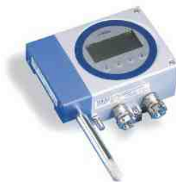
Vaisala HUMICAP® Humidity and Temperature Transmitter Series HMT360